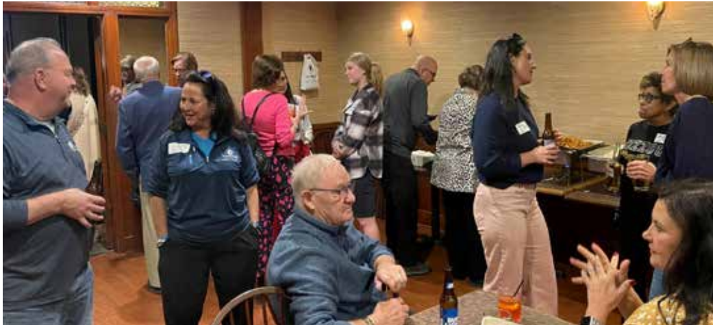
Chamber Connections was held Thursday, October 17. Chamber members networked and enjoyed delicious appetizers at Madison's Café. Thank you to our sponsors: River Region Credit Union and Madison's Café.