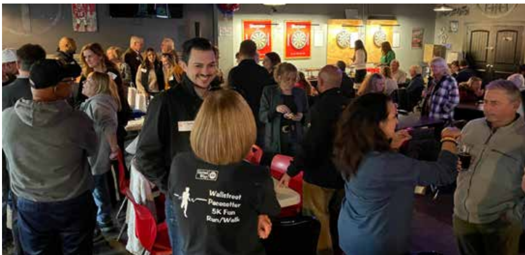
Chamber Connections was held Thursday, November 21. Chamber members networked and enjoyed the fun atmosphere at Water Tower Bar & Grill. Thank you to our sponsors: Acrisure and Water Tower Bar & Grill.